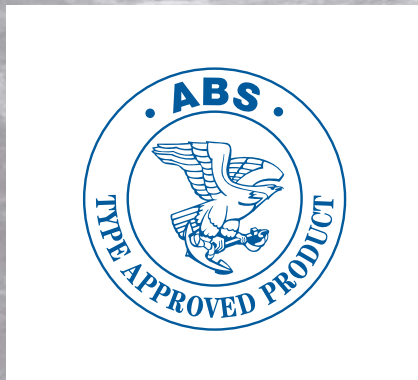
ABS TYPE APPROVED

Triplex Shark Jaws and Guiding Pins are designed in accordance to NMD regulations, are type approved by both ABS & DNV and has NO EXTRA LOCKING BOLT!