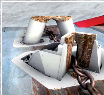
TRIPLEX SHARK JAW