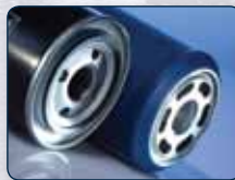
Low and high pressure applications