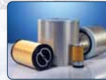
... of sizes and moulds