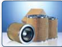
A filter for every fuel