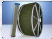
As recommended by makers