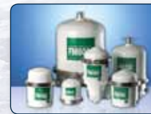
Astonishing results down to sub-micron size