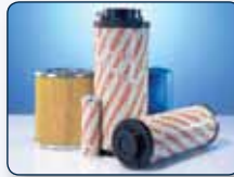
One-stop solution for your engine's filters

The outcome is a range of compact, long-life filter elements ready to meet the most demanding requirements.