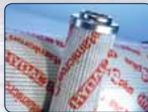
Joint forces with the world's leading company