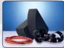
All needs covered