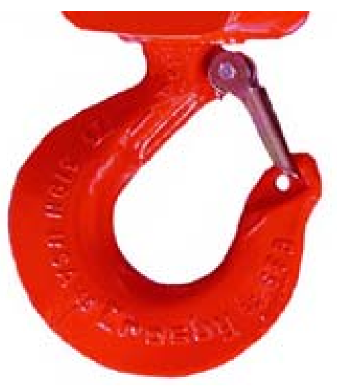
"World Class" latch that integrates into hook tip.