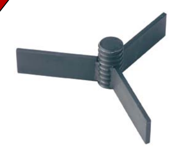
HR-500WF Welding Fixture

Aids in the welding process by ensuring proper alignment of nut onto cover.